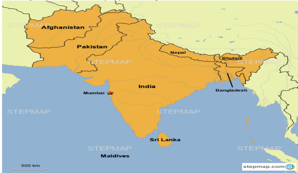
Figure 1: https://www.stepmap.com/map/southern-asia-cyE0voyJVO