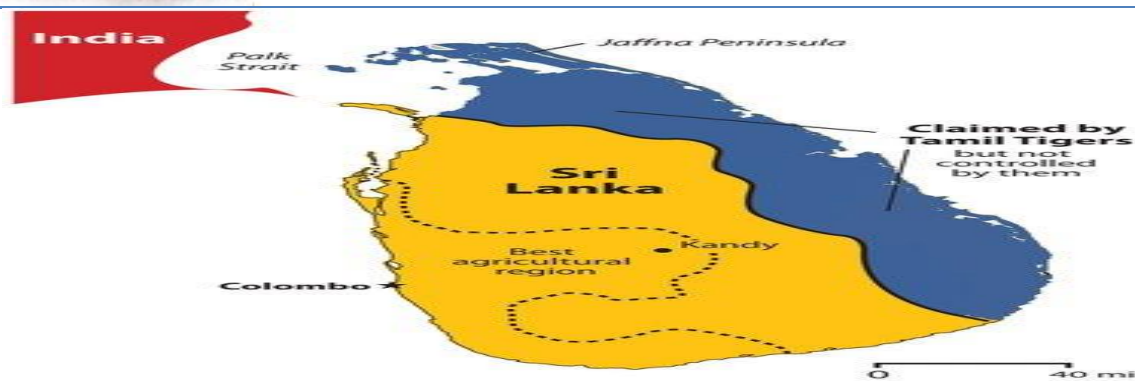
Figure 3: Sri Lanka Civil War map, https://www.sutori.com/story/copy-of-sri-lankan-civil-war--P5rNRC2XC83fgK6kvtn2rEnM

Furthermore, after independence, Sri Lanka adopted democratic parliamentary system. Due to the majority, Sinhala people succeeded in forming a government. Once they came into power by virtue of their majority, they adopted discriminatory policies towards the Tamils. Sinhalese racially discriminated them, forbade them for jobs and other government activities and businesses. (Gamage, 1993). As the majority of the Sinhalese gained power, they formulated policies of their benefit and interests. To weaken the identity of the Tamil people, the first Sinhalese government in the year of 1956 decided Sinhalese language as an national language in state, while English was the first language. (The official Language Act, 1956) Höglund & Orjuelahas summarized ethic conflict in these words,