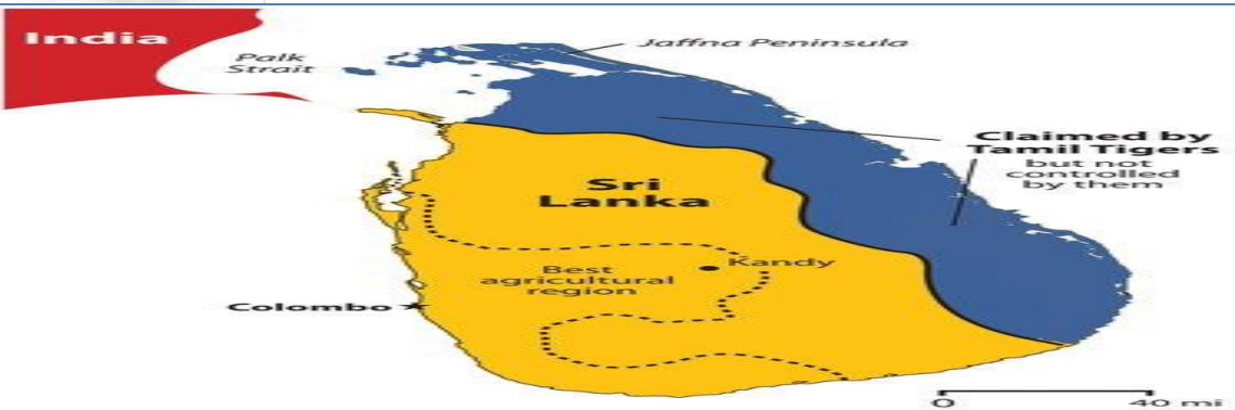
Figure 3: Sri Lanka Civil War map, https://www.sutori.com/story/copy-of-sri-lankan-civil-war-P5rNRC2XC83fgK6kvtn2rEnM

Furthermore, after independence, Sri Lanka adopted democratic parliamentary system. Due to the majority, Sinhala people succeeded in forming a government. Once they came into power by virtue of their majority, they adopted discriminatory policies towards the Tamils. Sinhalese racially discriminated them, forbade them for jobs and other government activities and businesses. (Gamage, 1993). As the majority of the Sinhalese gained power, they formulated policies of their benefit and interests. To weaken the identity of the Tamil people, the first Sinhalese government in the year of 1956 decided Sinhalese language as an national language in state, while English was the first language. (The official Language Act, 1956) Höglund & Orjuelahas summarized ethic conflict in these words,